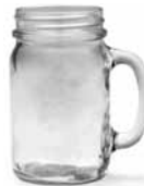
16 oz Glass Drinking Mug (#JAR16)