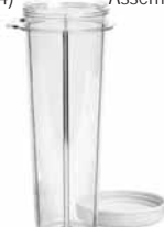
24 Oz BPA Free XL Cup with Lid (#PB02XLBF)