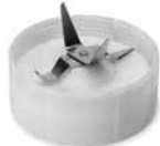
Blending Blade Assembly (#PB04)