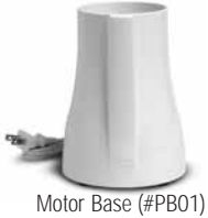
Motor Base (#PB01)

(Please call 888-254-7336 or visit www.tribestlife.com for availability and price)