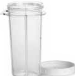
16 Oz BPA Free Blending Cup with Lid (#PB02BF)